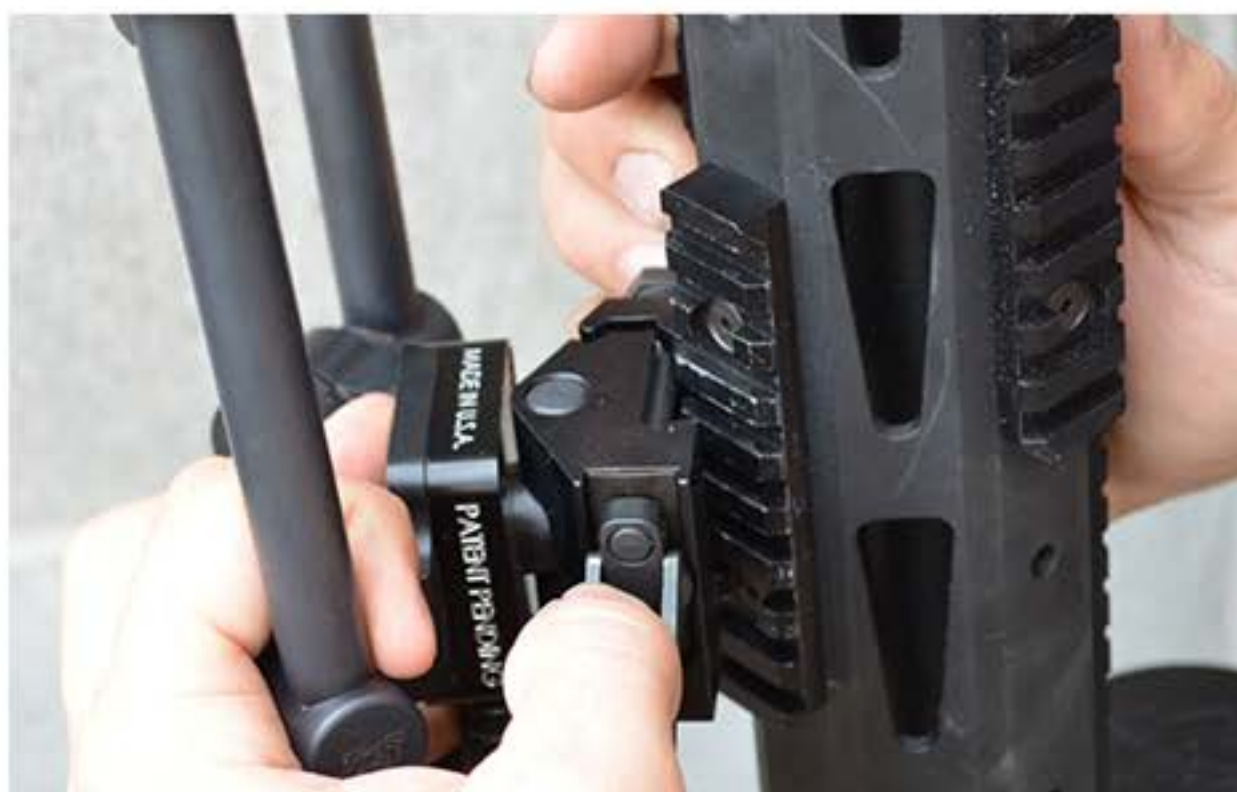
Figure 3: the bipod easily locks onto the cross-slots of the Picatinny rail

Step 5: Push the mounting latch forward to lock the bipod in place. If necessary, adjust the hex nuts. Your bipod is now properly adjusted and ready for use.