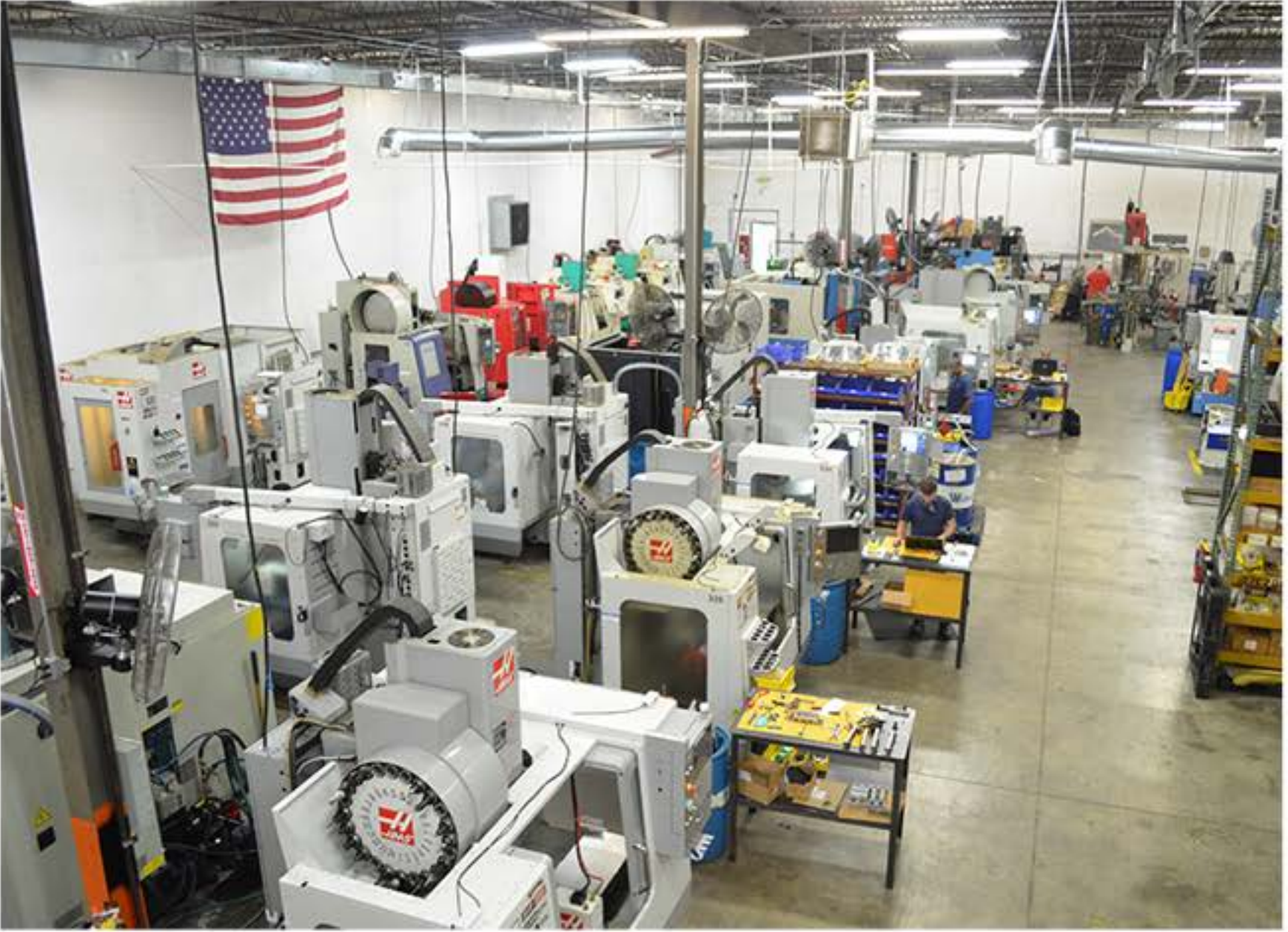
Figure 7: partial view of our manufacturing facility in Atlanta, Georgia

The Sierra 7™ bipod is proudly 100% designed, machined, and assembled in Atlanta, Georgia, U.S.A.