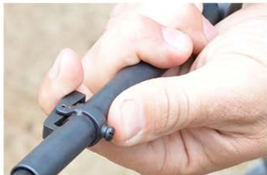
Figure 5: the spring-loaded legs are easily adjusted and automatically lock into place. No separate tensioning is necessary.

Adjust the height of the bipod legs by pressing the latches on the inside of the legs (Fig. 5). Each bipod leg can be individually adjusted for height. With one hand holding down the leg latch, push down on the bipod until it is at the desired height. Release the leg latch, the leg will lock securely. Use caution when releasing the legs, especially when they are fitted with Raptor feet.