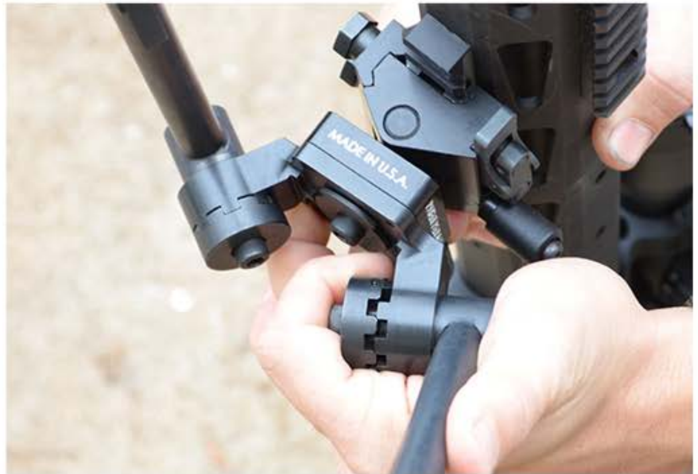
Figure 4: the two bipod legs can lock at separate angles, providing more stable footing on uneven terrain

Adjust the height of the bipod legs by pressing the latches on the inside of the legs (Fig. 5). Each bipod leg can be individually adjusted for height. With one hand holding down the leg latch, push down on the bipod until it is at the desired height. Release the leg latch, the leg will lock securely. Use caution when releasing the legs, especially when they are fitted with Raptor feet.