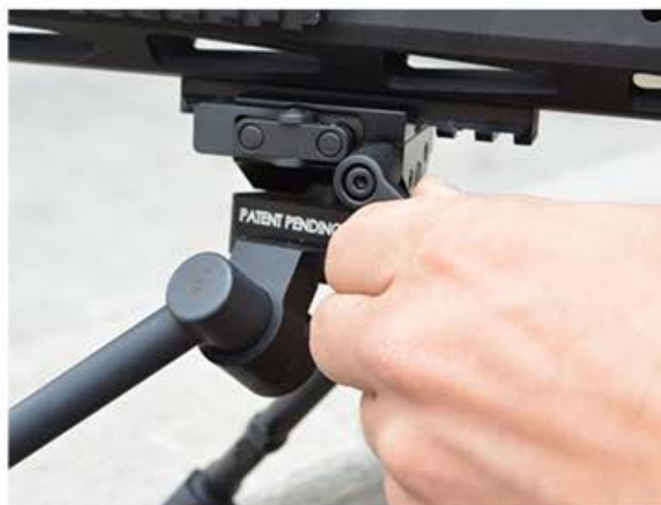
Figure 6: adjusting the lever latch

Adjust the spring-loaded lever latches by pulling out the lever latch and rotating it to the desired position (Fig. 6). The user can move the latches to the most comfortable and easily accessible position.