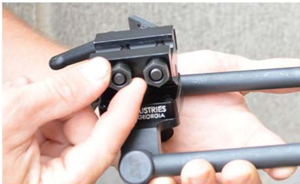
Figure 2: the adjustment knobs allow for easy installation of the bipod and a secure fit once on the rifle

Step 4: Align the two locking lugs with any two cross-slots on the rail. Catch one side onto the cross-slot, then fit the other side onto the rail. (Fig. 3)