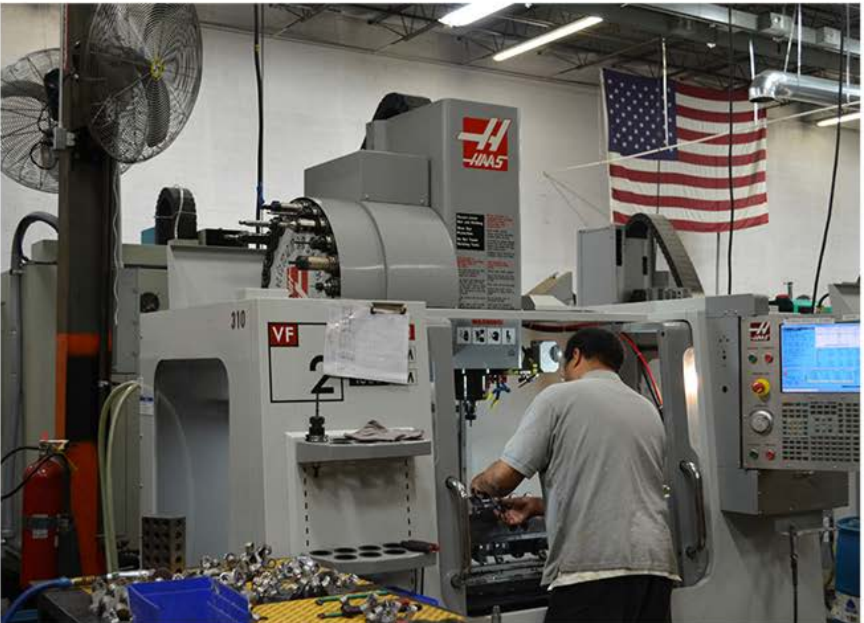
Figure 8: machining the main housing of the Sierra 7™ bipod